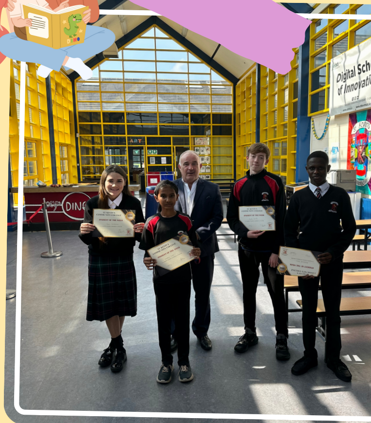
Student of the Week Winners - October 2023. Student of the week winners have excellent attendance records.