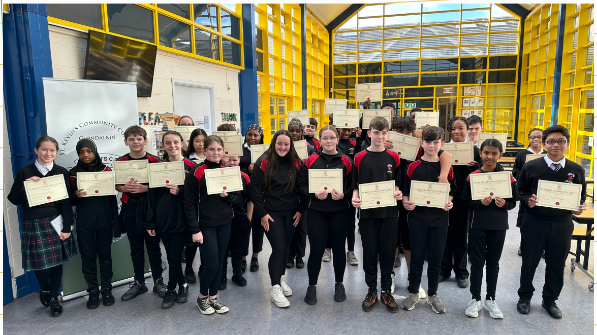
Students with Best Attendance prizes in November 2023