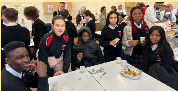
Students rewarded with a cooked breakfast by our Adult Ed Culinary Skills class for their excellent attendance

It's important to understand that the 90% applies to each subject. For example, if a student has 2 Maths classes per week and regularly misses 1 of them, then they will not meet the 90% target. It is really important that LCA students are here every single day.